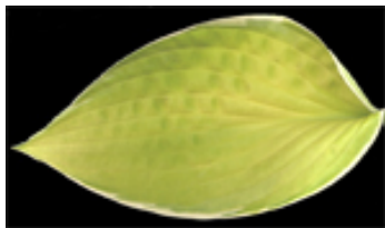
H. 'Academy Fire'

H. 'Academy Fire' is a first generation sport of h. 'Francee'.