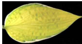
H. 'Patriot's Fire'

H. 'Patriot's Fire' is a second generation sport of h. 'Patriot'.