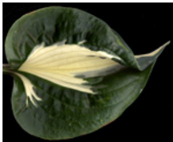
H. 'Woop Woop'

H. 'Woop Woop' is a second generation sport of h. 'Pathfinder'.