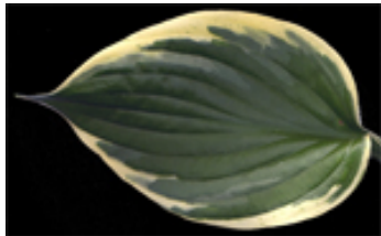
H. 'Olympic Glacier'

H. 'Olympic Glacier' is a second generation sport of h. 'Pathfinder'.