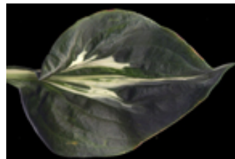
H. 'American Hero'

H. 'American Hero' is a third generation sport of h. 'Loyalist'