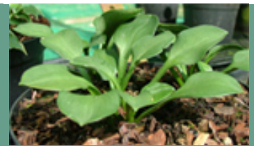
H. 'Green Mouse Ears'

The advice and opinions contained within this monthly newsletter have been formed over more than 30 years of experience with the Hosta genus. We are constantly learning and refining that knowledge and would welcome any suggestions that readers of this newsletter would like to make so please contact us .