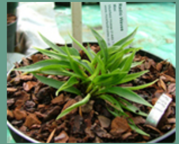
H. 'Radio Waves'

Potential candidates for the bonsai treatment might be: