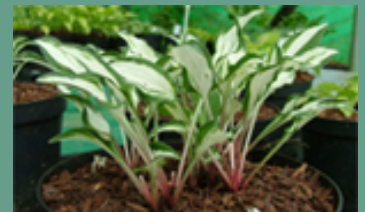
H. 'Lakeside Elfin Fire'