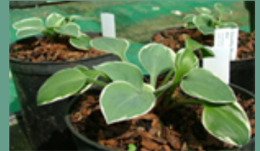
H. 'Country Mouse'