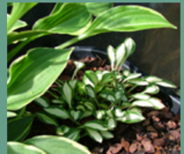
H. 'Cat's Eye'