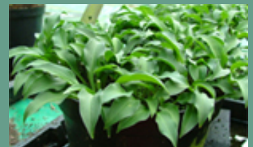
H. 'Yakushima Mizu'