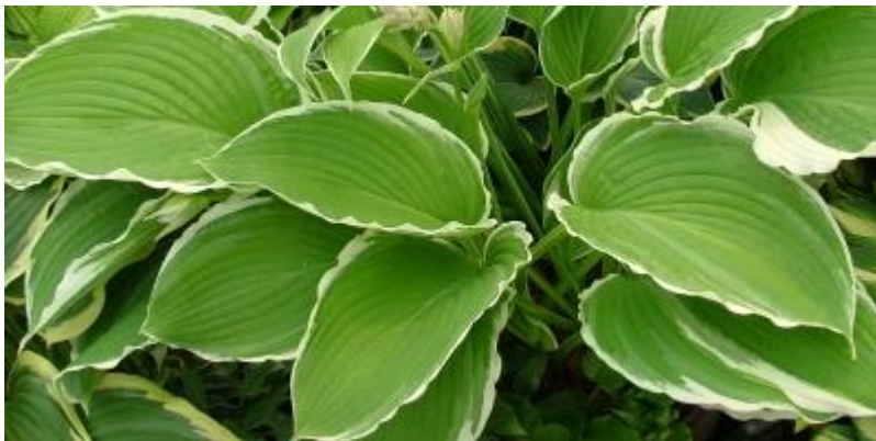
Hosta 'Frosted Jade'

This fabulous cultivar has H. montana origins, which are evident in the leaf shape and prominent veins. The colour is muted grey-green with grey streaking to the midrib. The white margins become more rippled with maturity and accentuate the leaf shape beautifully - a great giant for any garden.