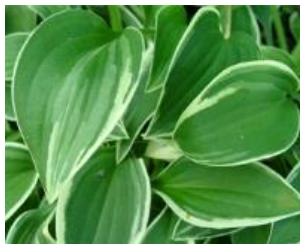
H. 'Rock Island Line'