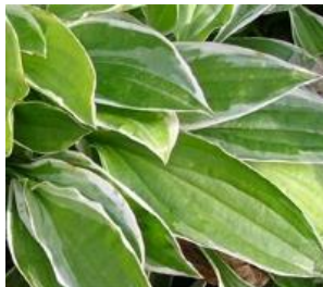
H. 'Tsugaru Komachi'

You will notice that all the little ones we recommend have delicate white margins rather than a striking white centre. We have found those with white centres can be very difficult to grow. They struggle to get established and often have very stringy root systems, which can prove to be insufficiently robust to support the plant. Our recommended varieties are not only robust, they produce generous amount of leaf, creating lovely neat mounds of foliage