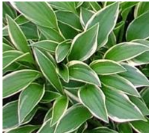
H. 'Lime Fizz'