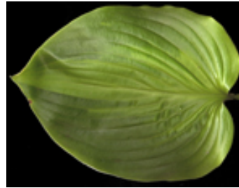
H. 'Holy Mole'