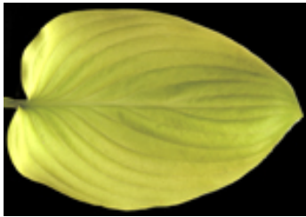
H. 'Fried Bananas'