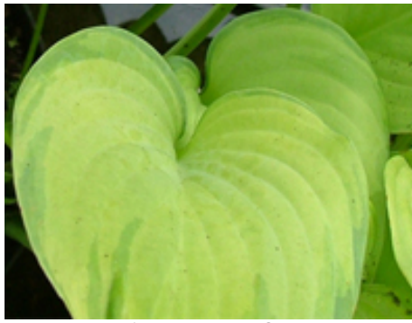
American Hosta Growers 'Hosta of the Year' 2002.

It is another excellent grower, which improves with maturity, and has produced some very notable sports: