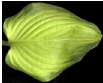
H. 'Stained Glass'