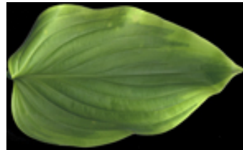
H. 'Paradise Sunshine'