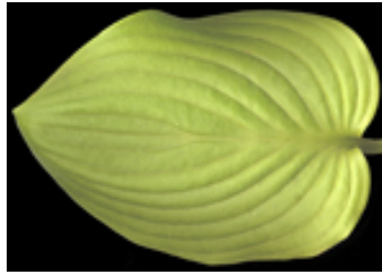
H. 'Fried Green Tomatoes'