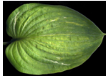
H. 'Spilt Milk'