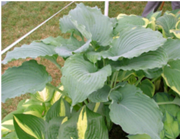
H. 'Queen of the Seas'