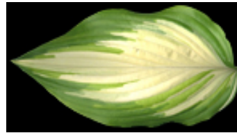
H. 'Sea Thunder' H. 'Sea Yellow Sunrise'