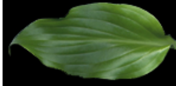
H. 'Red Salamander' H. 'Richmond' H. 'Sea Beacon' H. 'Sea Current' H. 'Sea Dream' H. 'Sea Fire'