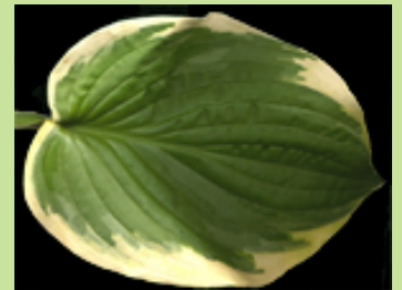
H. 'Goldbrook Gratis'

This fantastic cultivar is so heavily rugose, with an intensity of colour, which develops with maturity.