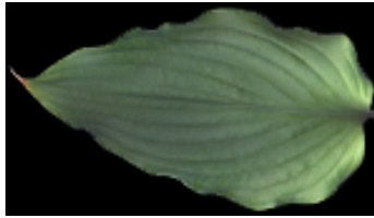
H. 'Komodo Dragon'