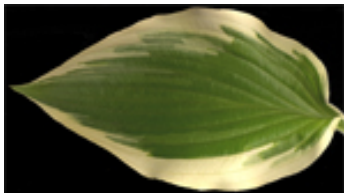
H. 'Don Stevens' H. 'El Dorado' H. 'High Noon'