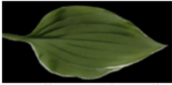
H. 'Allan P McConnell' H. 'Blue Plate Special' H. 'Bold and Brassy' H. 'Christmas Gold'

the years, working in collaboration with other key breeders and members of the American Hosta Society. As a result of her desire to breed good quality cultivars, her introductions are distinctive, see the American Hosta Society website for a full list. We hold around a third of these cultivars in our National Collection, which we list below - click on the names to find out more: