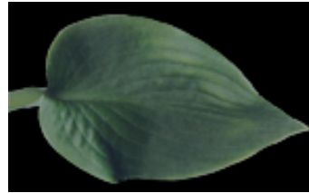
H. 'Sea Lotus Leaf' H. 'Sea Mist' H. 'Sea Monster' H. 'Sea Nymph' H. 'Sea Slate II'