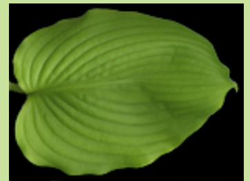
H. 'Hoosier Dome'

This sport of H. 'Mildred Seaver' becomes more apparently different as it matures.