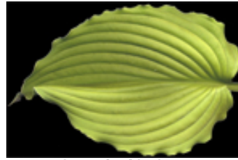
H. 'Sea Gulf' Stream' H. 'Sea Hero'