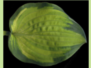
H. 'Brother Stefan'