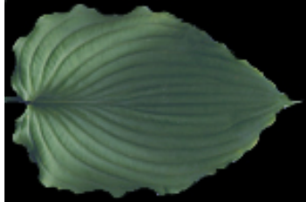
H. 'Queen of the Seas'