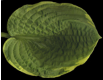
H. 'Christmas Tree'