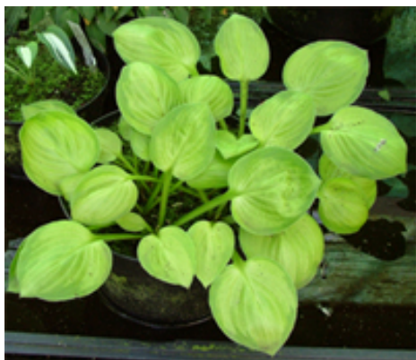
H. 'Peppermint Cream'

This sport has the reverse colouring of h. 'Heart and Soul'.