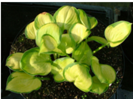
H. 'Wylde Green Cream'

This sport has very subtle chartreuse margins to the gold leaves.