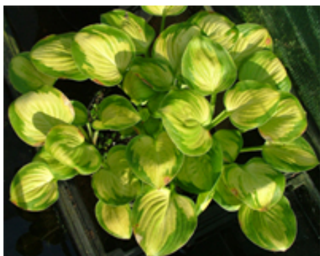
H. 'Heart and Soul'

This cultivar has very glossy leaves, which emerge dark green and become chartreuse by summer.