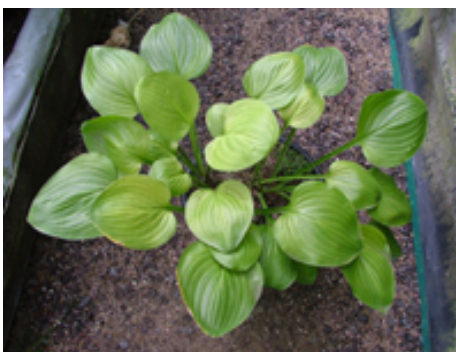
H. 'Academy Flaxen Spades'

Click on the individual plant names to find out more.