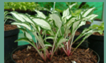
H. 'Lakeside Elfin Fire'