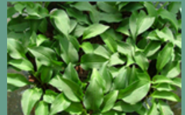
H. 'Paradise Puppet'

Some varieties struggle to establish but some are excellent growers. The following cultivars from h. venusta , are not only favourites of ours they are also highly popular with customers and collectors: