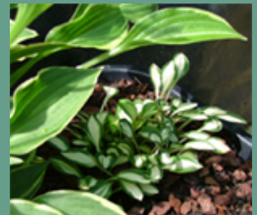
H. 'Cat's Eye'