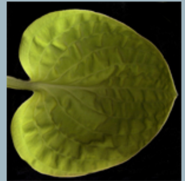
h. 'Eye Catcher'

The classic cultivar that exhibits different colouration depending upon its growing conditions is h. 'June' , which is why we recommend it as an excellent beginners plant. It encourages gardeners to think about the effect growing conditions can have on a plant. Other modern classics with distinctive colouration include: