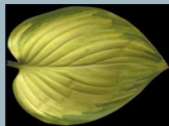
h. 'Stained Glass'

colour from green through yellow to creamy white.