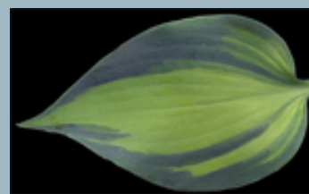
h. 'Touch of Class'

The leaves improve in colouration and texture as the season progresses culminating in a spectacular display in autumn - this variety also has very fragrant flowers.