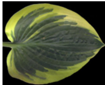
h. 'First Frost'

The leaves emerge with yellow margins that turn pure white.