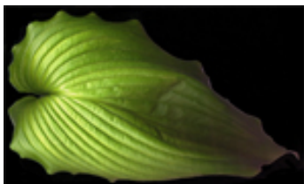
h. 'War Paint'

The leaves emerge with a striking variegation, which gradually fades as the center darkens to a light green.