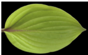
h. 'Fire Island'

New leaves emerge bright yellow-green and turn a chartreuse green through the season.