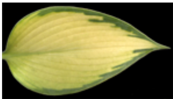
h. 'Kathryn Lewis'

The leaves emerge blue-green and change to gold leaves with a blue-green edge.