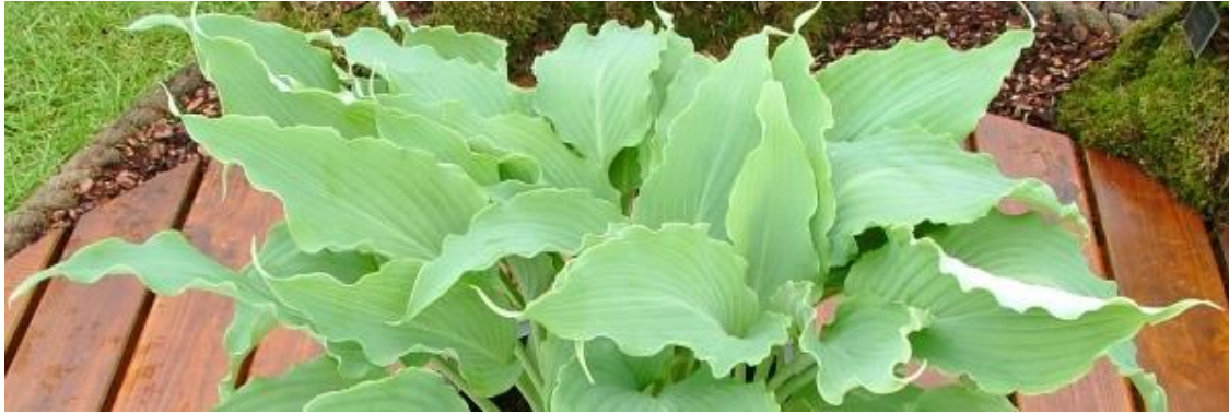
Hosta 'Neptune': celebrating shape and form of specimen cultivars