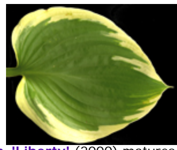
As h. 'Liberty' (2000) matures, the margins become more orange-yellow and the leaves more textured.

Our current favourite sports of h. 'Sagae' are h. 'Magic Fire' and h. 'Liberty':