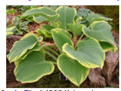
H. 'Magic Fire' (2004) has deeper, more streaked margins and a flame-like twist to the leaves.